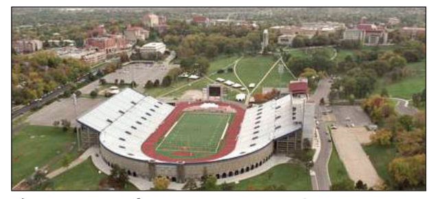
The University of Kansas - Lawrence, KS