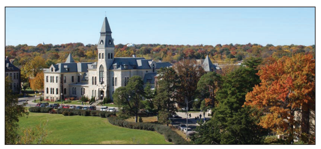
Kansas State University - Manhattan, KS