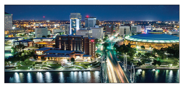
Wichita, KS - Cityscape