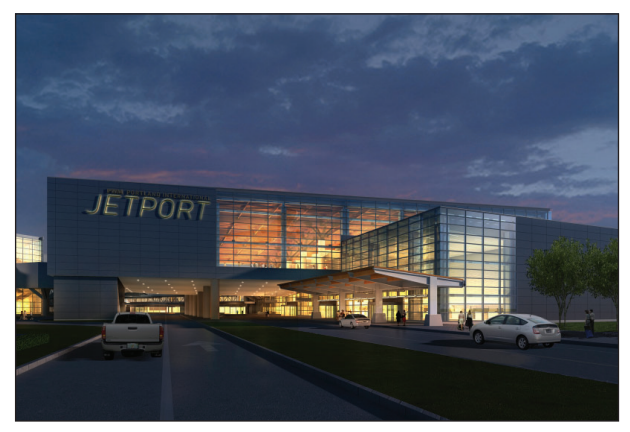
Airport Terminal Expansion - Portland, ME