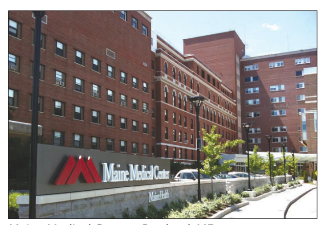
Maine Medical Center - Portland, ME