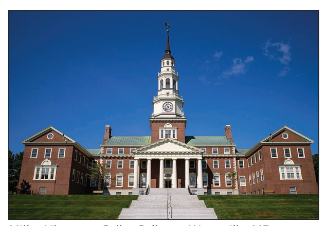
Miller Library at Colby College - Waterville, ME