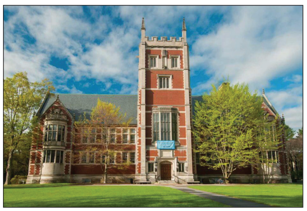
Hubbard Hall at Bowdoin College - Brunswick, ME

The Fund primarily purchases municipal bonds that are rated investment grade by independent ratings agencies at the time of purchase. The Fund may buy non-rated municipal bonds if the investment manager deems them to be of investment grade equivalent.