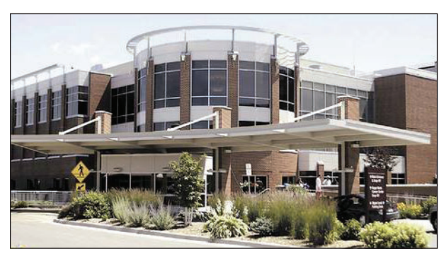
Sanford Health - Fargo, ND