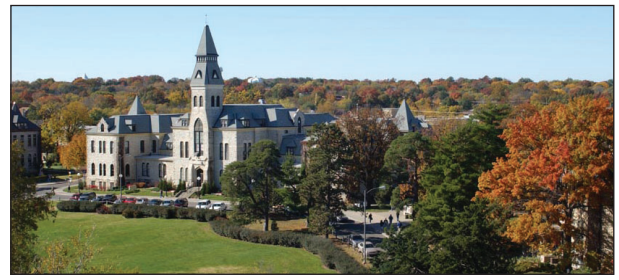
Kansas State University - Manhattan, KS