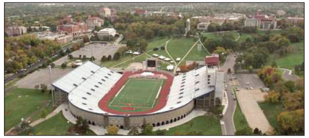
The University of Kansas - Lawrence, KS