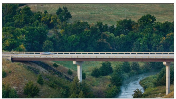
Highway 83 Overlook

The Fund primarily purchases municipal bonds that are rated investment grade by independent ratings agencies at the time of purchase. The Fund may buy non-rated municipal bonds if the investment manager deems them to be of investment grade equivalent.