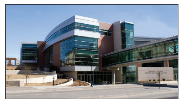
Sorrell Center University of Nebraska Medical Center