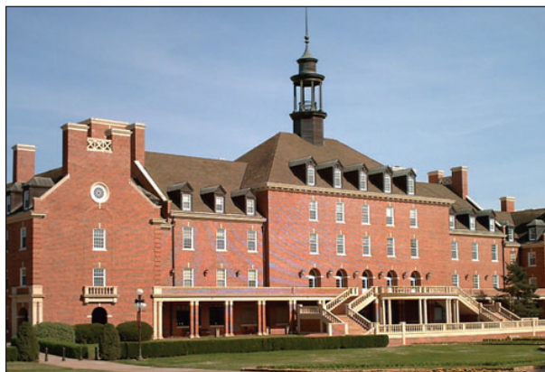
Oklahoma State University - Stillwater, OK

The Fund primarily purchases municipal bonds that are rated investment grade by independent ratings agencies at the time of purchase. The Fund may buy non-rated municipal bonds if the investment manager deems them to be of investment grade equivalent.