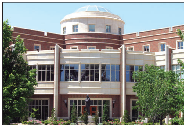
University of Oklahoma - Norman, OK