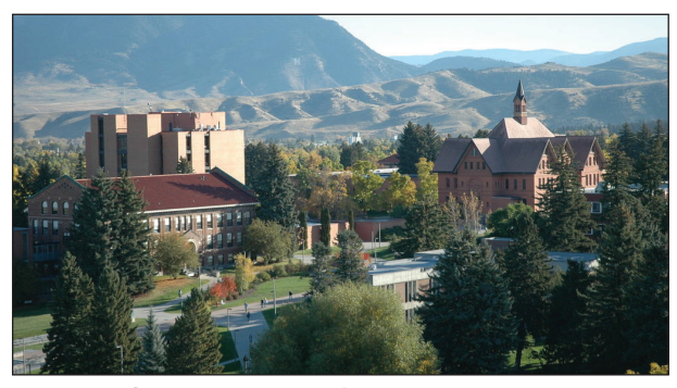
Montana State University - Bozeman, MT