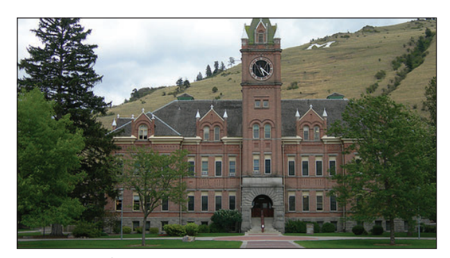
University of Montana - Missoula, MT