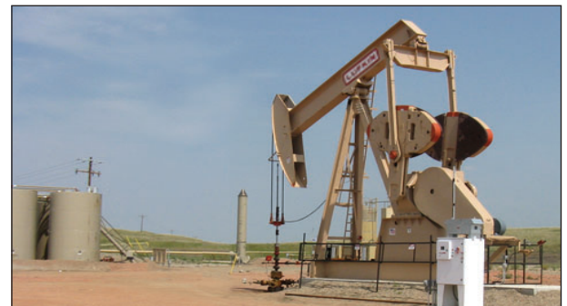
North Dakota Oil Production