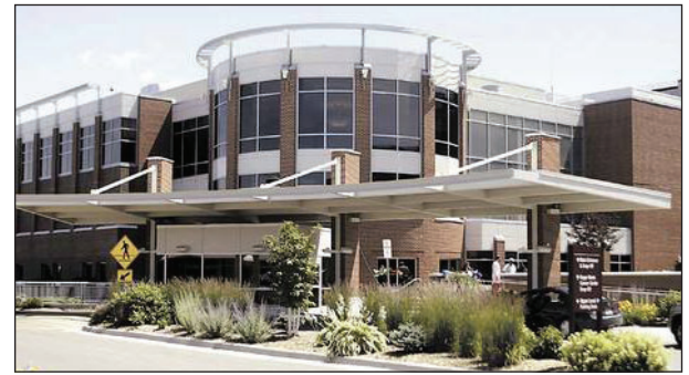
Sanford Health - Fargo, ND