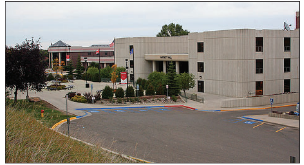
Minot State University - Minot, ND

The Fund primarily purchases municipal bonds that are rated investment grade by independent ratings agencies at the time of purchase. The Fund may buy non-rated municipal bonds if the investment manager deems them to be of investment grade equivalent.