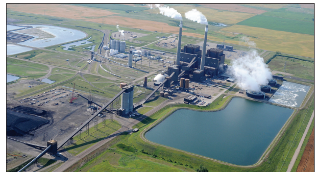
Coal Creek Station - Underwood, ND