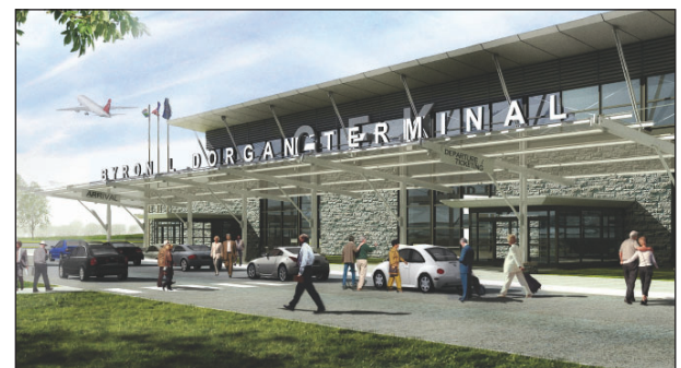
Grand Forks International Airport - Grand Forks, ND